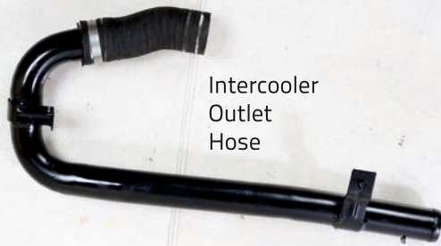
Intercooler Outlet Hose