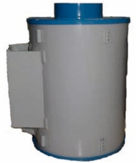
Uni -Mist Collector Unit Domestic