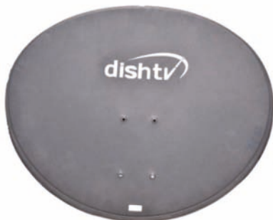
Dish- TV Antenna Domestic