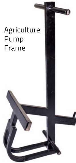
Agriculture Pump Frame