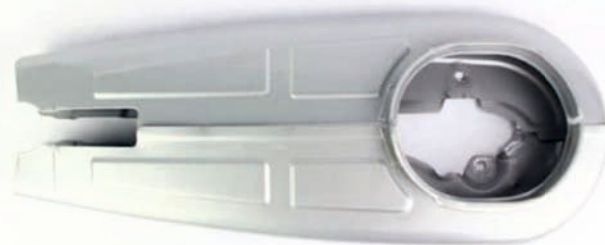
Chain Cover for Motor Cycle