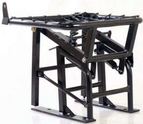
Single Seater Base Frame for Passanger Bus - with folding System