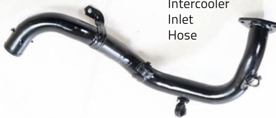
Intercooler Inlet Hose