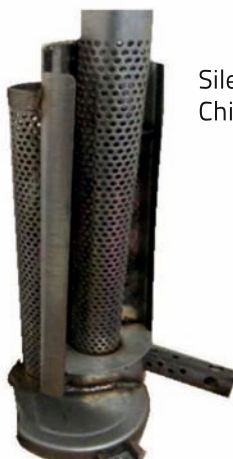
Silencer Assembly Child Parts