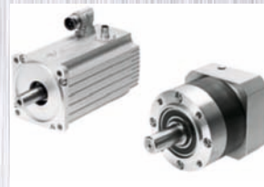
Motors and Controllers