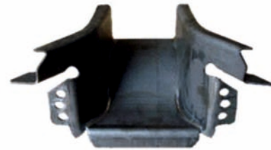
Cross Member Bracket