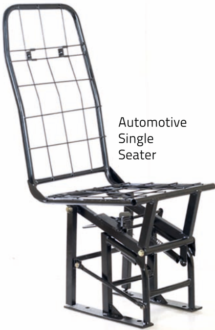
Automotive Single Seater

We offer a spectrum of products customized for our clients' needs. They include Sheet Metal Press Parts, Deep Draw Press Parts, Tubular Pipe Bending Components, & Welded Assemblies.