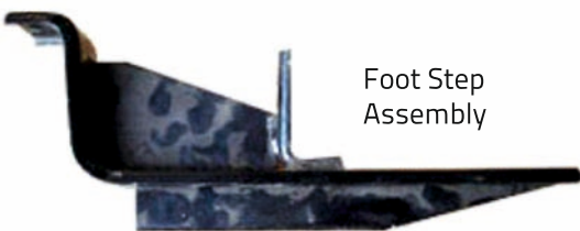
Foot Step Assembly