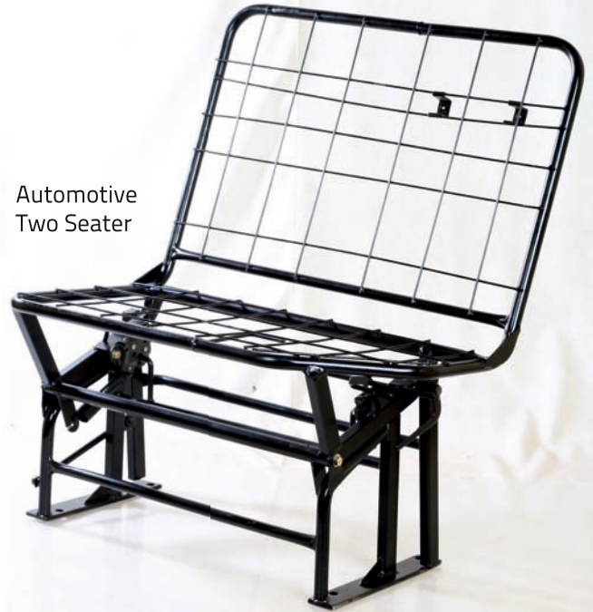
Automotive Two Seater