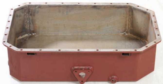
Oil Sump for Engine Assembly